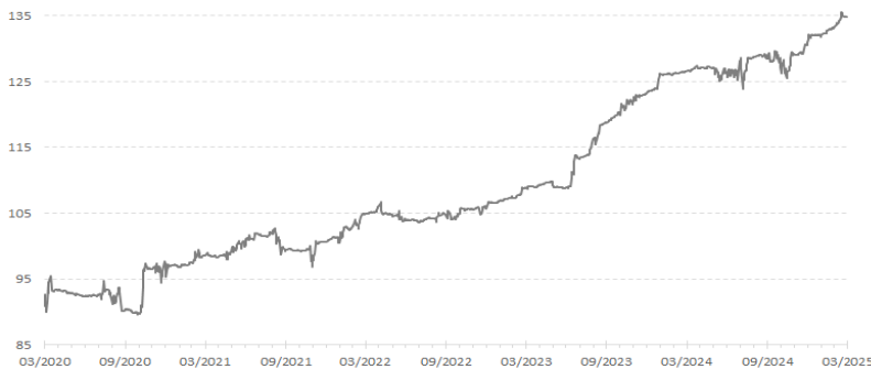
Five year performance, dividends re-invested (GBP)